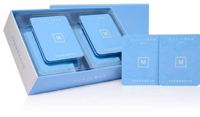
HYDRAONE MASK X 8