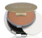
BRONZER FOUNDATION 525 CARAMEL BRONZING