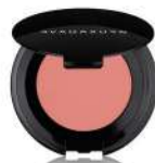
FUSION BLUSH 346 ROSE PEACH