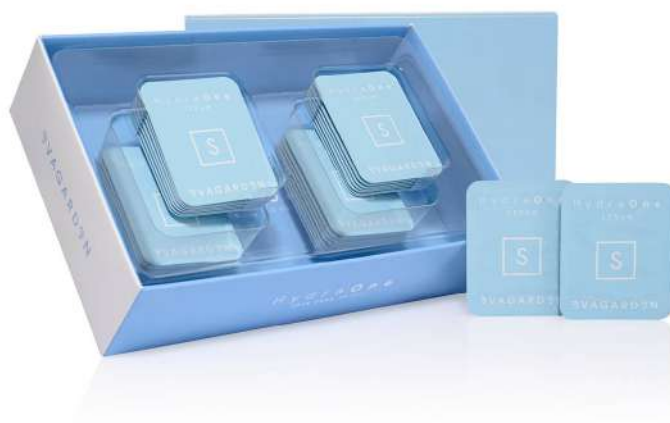
HYDRAONE SERUM X 28