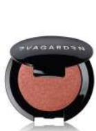
GLARING EYE SHADOW 265 RED CLAY