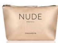
POCHETTE NUDE THEORY