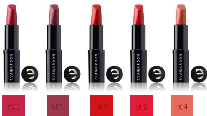
590 ROSE RED 591 MAUVEWOOD 592 CHERRY RED 593 RASPBERRY 594 CORAL HAZE

Care Colour Lipstick: the lipstick treatment featuring pure, super bright colours with a long-lasting effect, ensuring extreme comfort for your lips.