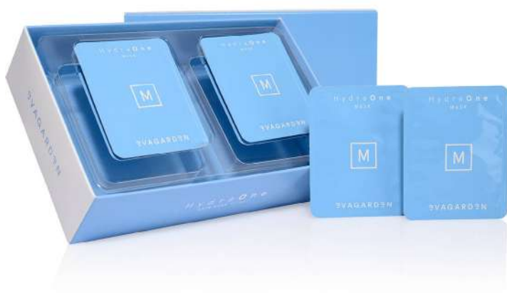
HYDRAONE MASK X 4

Specifically designed, HydraOne Mask enwraps the skin with a refreshing gelee texture for a deeply hydrated, firmer and revitalized skin. Enriched with the TRIPLE ACTION HYDRAONE COMPLEX, HydraOne Mask offers long-term moisturization effect. A pleasant and delicate fresh feeling when held at room temperature, a cooling icy and soothing effect when stored in the fridge.