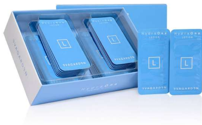
HYDRAONE LOTION X 28