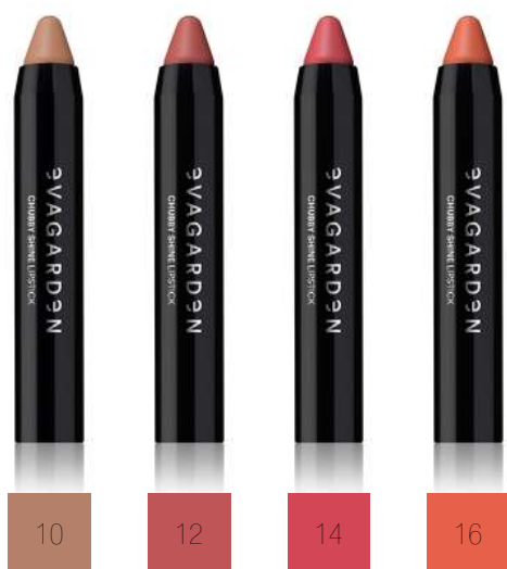
10 PEACH QUARZ 12 BLOOMIN DAHLIA 14 FIESTA 16 PEACH ECHO

The result is a creamy balm, unparalleled moisturising consistency that combines sensoriality with a deep treatment for absolute comfort.