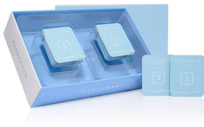
HYDRAONE SERUM X 14

HydraOne Serum feeds the skin with water and nutrition and optimizes the moisture flow. Enriched with the TRIPLE ACTION HYDRAONE COMPLEX, it renders the skin softer, suppler and bouncy with the creation of water in the deeper layers of the skin itself, for a refreshed and re-plumped look.