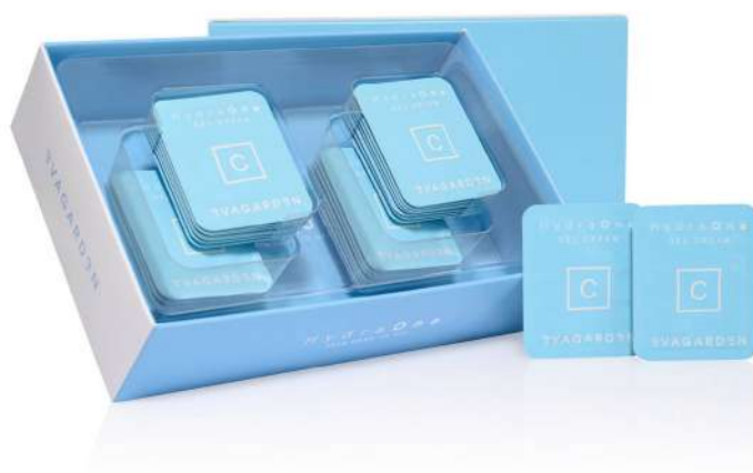
HYDRAONE GEL CREAM X 28