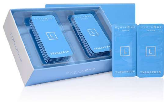
HYDRAONE LOTION X 14

HydraOne Lotion refreshes and regulates the skin moisture balance. Enriched with TRIPLE ACTION HYDRAONE COMPLEX, it helps to maintain moisturization throughout the day. HydraOne Lotion is the ideal booster that prepares the skin to maximize the efficacy of the following skin care HydraOne treatments.