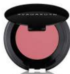
FUSION BLUSH 345 SHEER PINK