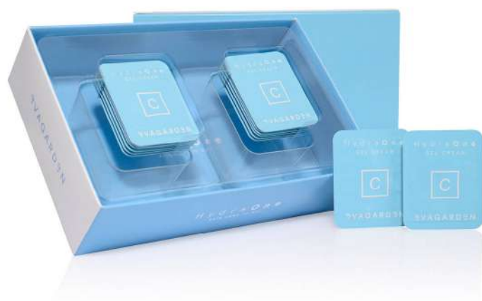
HYDRAONE FACE CREAM X 14

Smoother and richer than a normal gel, and more refreshing than an ordinary cream, HydraOne Gel Cream brings the most ideally-balanced moisturizing finish to the skin. Reinforced with the TRIPLE ACTION HYDRAONE COMPLEX, it deeply and long-lastingly nourishes the skin, leaving a soft and non-sticky finish.