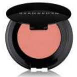
SMART BLUSH 331 COPPER TAN