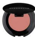
REBEL MAT LIPSTICK 49 DARK RUBY